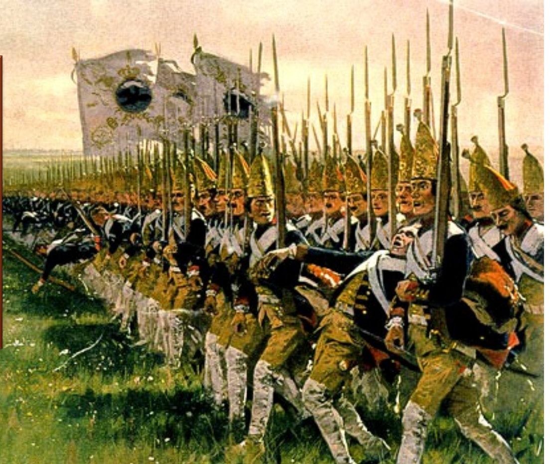
Carl Röchling (d. 1920), Attack of the Prussian Infantry